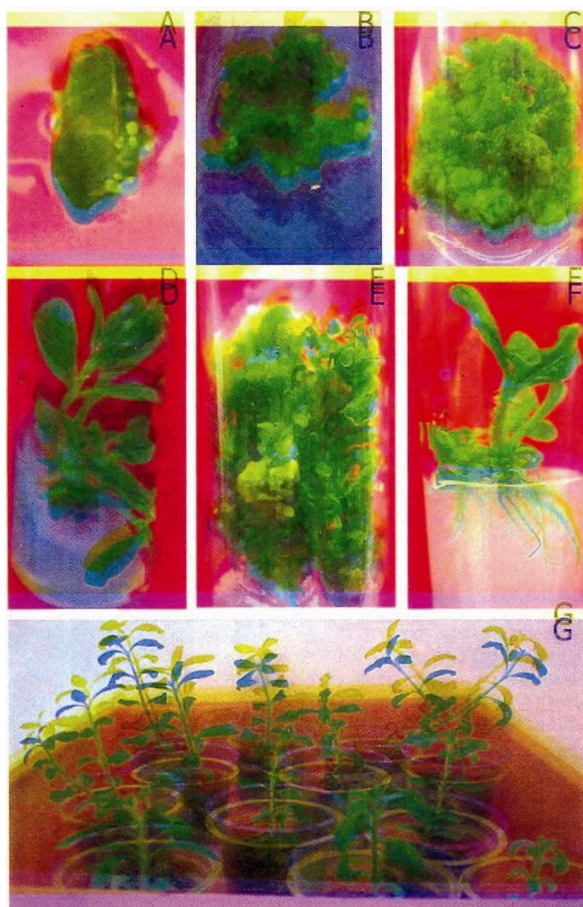
Fig. 1—Plant regeneration in Asteracantha longifolia . (A)—Protuberances at the cut end of leaf explant implanted on MS+ 1.5 mg/l BA; (B)—Multiple shoot initials after 5 th week on MS BA (1.5mg/l); (C)—Greenish, hard, compact calli developed after 6 th week on MS + BA (2.0mg/l) + NAA (0.5mg/l); (D)—Well developed multiple shoots after 8 th week; (E)—Shoot bud regeneration from the callus after 8 th week; (F)—Shoot showing profuse rooting on MS + NAA (0.1mg/l); and (G)—A set of regenerated plantlets in plastic cups containing sand and soil mixture

including non-organogenic callus, organogenic callus, organogenic callus with multiple shoot initials and rhizogenesis, to analyse the role of biomolecules content during regeneration. The protein content was maximum at organogenic callus with multiple shoot initials followed by organogenic callus, non