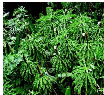
Plant of Costus speciosus

IPC code; Int. cl. 8 — A61K 36/00, A61K 36/906, A61K 125/00, A61P 1/16