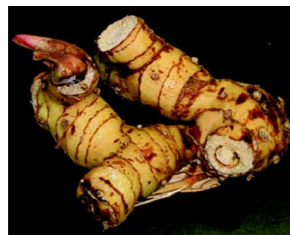
Rhizome of Costus speciosus