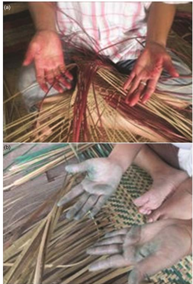
Fig. 7—A & B: The effect of dyes on artisans

recipe it should take about 3-4 minutes for the sedge to be dyed. There are problems with the use of dyes, including harmful effects on the environment and artisans. This is an area for future research and by eliminating the use of chemical dyes or by educating locals into their proper handling, the artisans will greatly benefit.