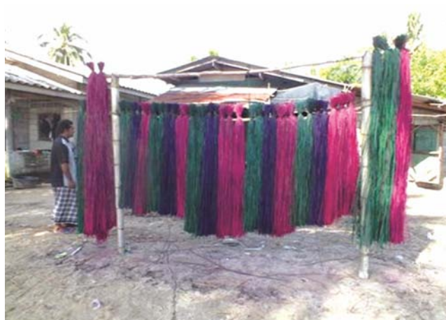
Fig. 5—Dyed sedge strands hung up to dry

Ban Kuan Yao Grey-Sedge Product Transformation Group soak their sedge in water before the dyeing process and they also use a wooden stick to stir the sedge in the dye and ensure that the colour coverage is complete. Ban Huay Leug Community Grey-Sedge Weaving Handicraft Corporation divide their sedge crop into bundles of 20-25 stalks and also soak their sedge in water before dyeing. The sedge is boiled in the dye for 15-20 minutes and, after being removed, is cleaned thoroughly to remove excess dye. The dyed sedge is taken to dry in the sun and, once dry, is flattened in preparation for product transformation.