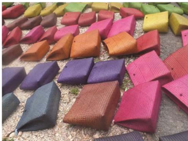
Fig. 4—The use of colour in grey-sedge products

dyeing procedure. The sedge strands that have been selected, bound and dried will be cleaned before the dyeing process, so to remove excess mud bonding. The strands are dyed in small bunches, which are split further into four and each minor bunch is folded before being submerged in the dye water. The sedge is dyed in small portions because large portions will cause the dye to be spread unevenly and insufficiently cover the stalks. Bowls or drums are used for dyeing. Water is brought to the boil in the drum over a coal stove and chemical dyes are added. The dye is allowed to mix with the water and a little vinegar and salt are added to protect against colour running. The sedge is submerged and left in the dye mixture for 5 minutes, before being washed in clean water twice. The strands are then hung to dry and rolled so that they are dry, soft and ready for weaving. For the production of bags and baskets, the sedge strands must be shaped before the drying process. The sedge must not be left outside overnight because mould could grow on the strands and ruin them.