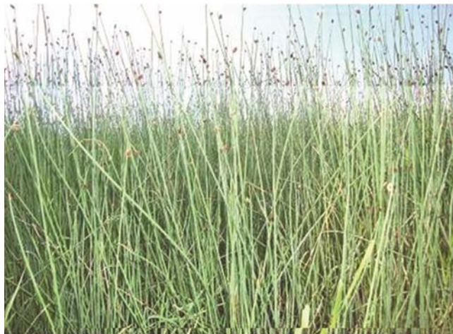
Fig. 1—'Grey Sedge' ( Lepironia )