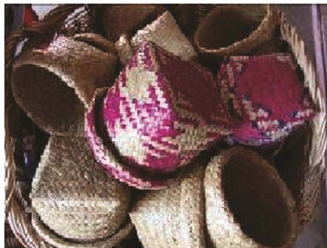
Fig. 2—Transformed sedge baskets