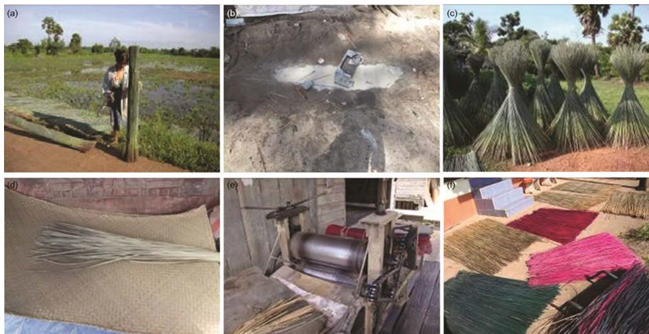
Fig. 3—A – Sizing of grey sedge plants in preparation for production; B – Tools used for mud binding; C – Sedge bundles drying in the sun; D – Dried sedge resting; E – A sedge-flattening machine; F – Dyed sedge stalks

integrated to pattern designs (Fig. 4). Ban Bueng Pichai Professional Grey-Sedge Weaving Group and Ban Khok Mao Grey-Sedge Production Group use similar methods. The sedge is dyed in boiling dye water before being hung and dried. There are no extra techniques of flattening or cleaning. However, the remaining eight groups adopt unique and slightly different dyeing procedures.