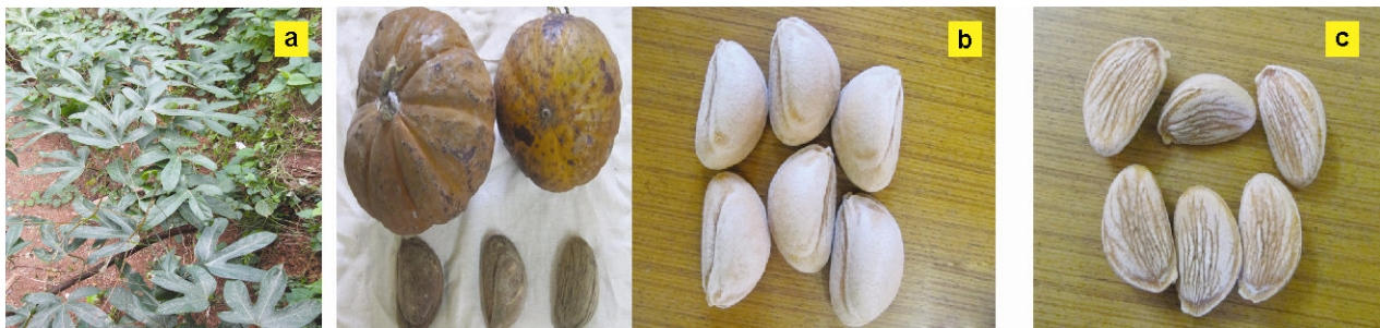
Plate 1– a. Hodgsonia heteroclita in domesticated habitat; b. Fruits and seeds; c. Endosperms

During the field surveys, it was observed that most of the tribal communities of NEH region were very much acquainted with the different uses of H. heteroclita . Though primarily a wild-growing species, the plant was also observed being domesticated in backyards/ kitchen gardens in most of the tribal villages for consumption of its seed (nut) as food and medicine. Its seed are also sold in the local market. Karbis and Dimasa tribes of Assam use its kernels after roasting or baking and seed oil (62-71 %) for cooking food and preparation of other food items, beverages, etc. Apatani , Bogums , Bomis and Nishi tribes of Arunachal Pradesh; Khasi , Garo , and Jaintia tribes of Meghalaya; Chakma , Hajong , Tongbe and Riang tribes of Mizoram use roasted seeds by mixing these with different food items mainly to garnish vegetarian and non-vegetarian food items. Naga and Kuki tribes of Manipur and Angamis and Rengma of Nagaland use a tea spoon of crushed seeds for the treatment of intestinal worms. The roasted seeds/endosperm by mixing with other food items is given to the women and children as energetic food. In Nagaland, Angamis and Rengma tribes apply the fruit pulp to cure bacterial infections of feet. Naga also uses extract of this plant in various types of curry. Seed powder is given in indigestion and stomach pain. Bhil , Chaimal , Mizel and Orang tribes of Tripura apply leaf juice on fresh cuts and wounds