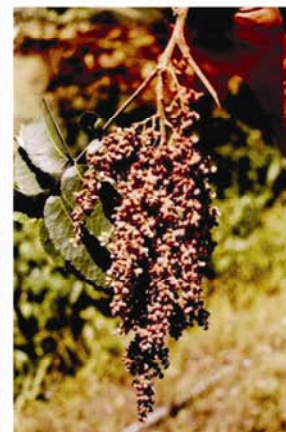
Fig.7 Rhus semialata Murr.