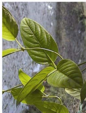
Fig.6 Paederia foetida Linn.