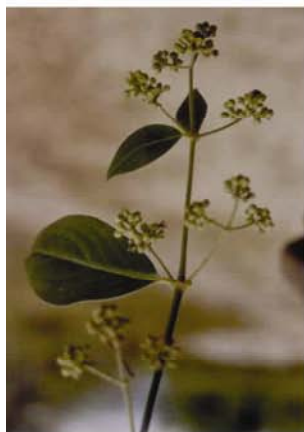
Fig.4 H. scandens Roxb.