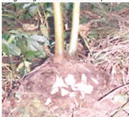
Fig.11 Angiopteris evecta (Forst) Hoffin