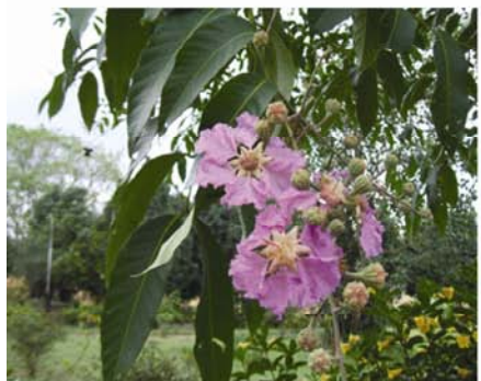
Fig.8 Lagerstroemia macrocarpa Wt.