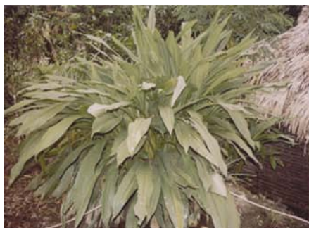
Fig.1 Curcuma caesia Roxb.