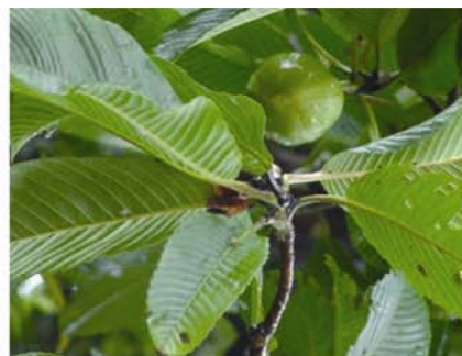
Fig.3 Dillenia indica