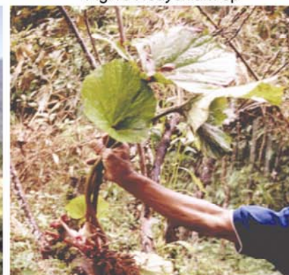
Fig.12 Begonia josephii A. DC.