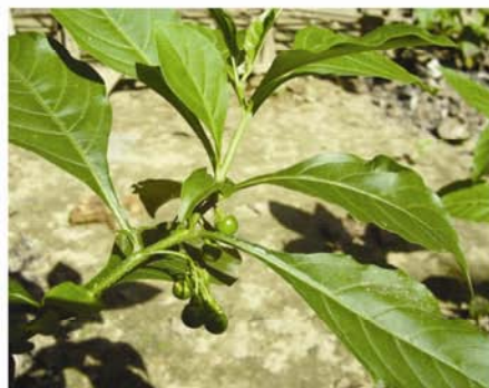
Fig.9 Solanum spirale Roxb.