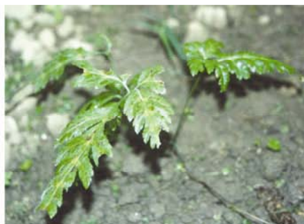
Fig.2 Coptis teeta Wall.