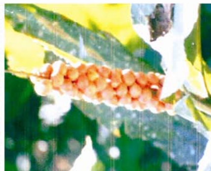
Fig.10 Hedychium sp