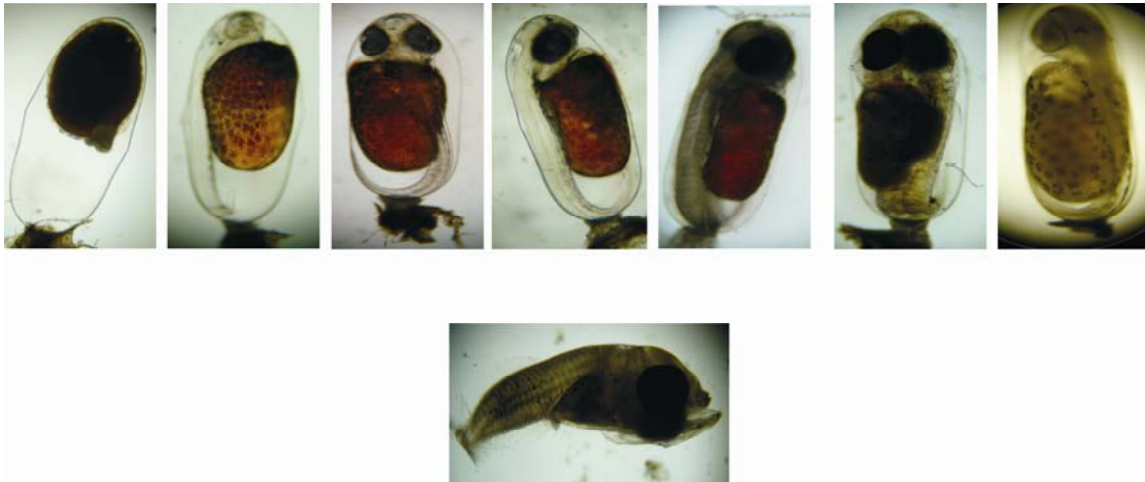
Fig. 3—Embryonic development and newly hatched larvae