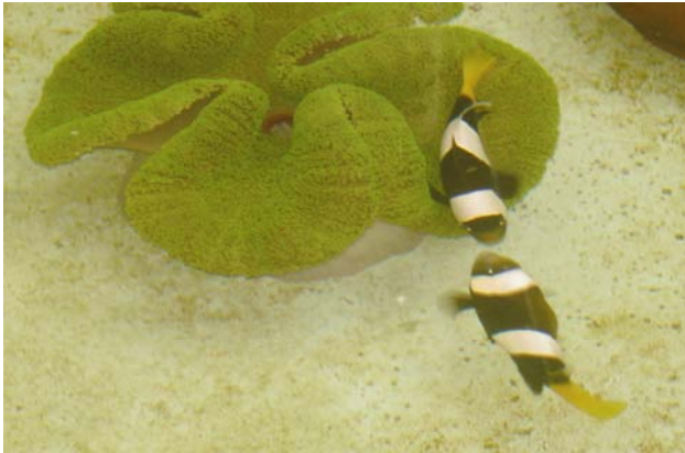
Fig. 1—Spawning pair Amphiprion sebae

with host anemone, Stichodactylus [a 13 ] haddoni 8 . After acclimatization, they were keenly observed for an [a 14 ] injury or any sign of diseases. After making sure, 10 numbers of uniform size [a 15 ] fishes and 5 anemones were transferred to a 5 ton cement tank (conditioning tank) filled with 2 ton water where a under water filtration system was provided, which was made using activated carbon, ceramic ring and coral sand. The fishes were fed thrice a day with different feeds such as live Acetes, trash fish, meats of clam, mussels, squids etc. After 2 months, one pair measuring 5-7 cm grew ahead of others and that was transferred to [a 16 ] 1 ton FRP tank (spawning tank). The photoperiod [a 17 ] maintained 12 hr. light and 12 hr. darkness using artificial light. The submerged objects such as tile, earthen pot, PVC pipe etc., were placed in the bottom of the tank on which the fishes were