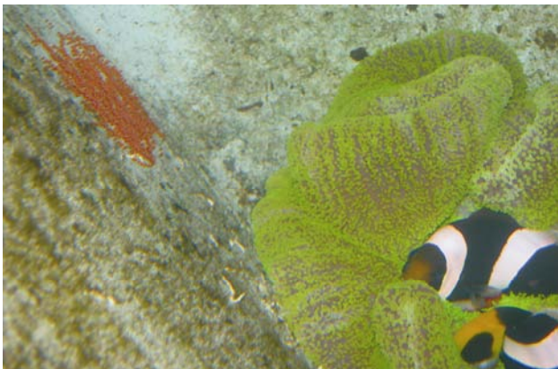
Fig. 2—Egg clutch along parents

spawned. Spawning took place on 4 th month after a brief courtship (Fig. 2). Embryonic development of eggs was studied on daily basis (Fig. 3). The water quality parameters such as temperature, salinity and pH were measured regularly using [a 18 ] standard methodologies.