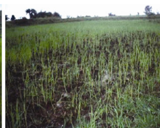
Fig 4— Badi lochai variety of indigenous paddy