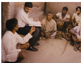
Fig 1—Focus group discussion