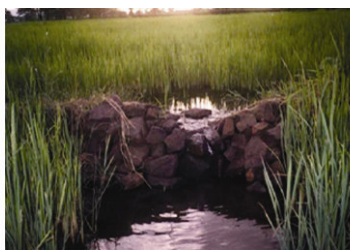
Fig 2—Average productivity of indigenous paddy varieties