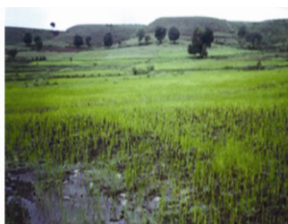
Fig 3— Sathiya variety of indigenous paddy