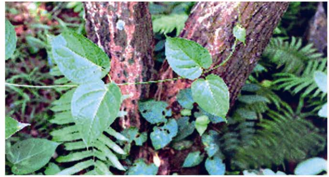
Fig. 2 Oregea volubilis Benth.