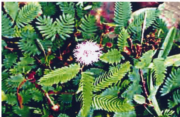
Fig. 3 Mimosa pudica Linn.