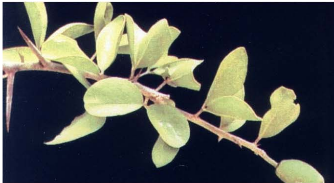
Fig. 1 Balanites aegyptiaca Delile.