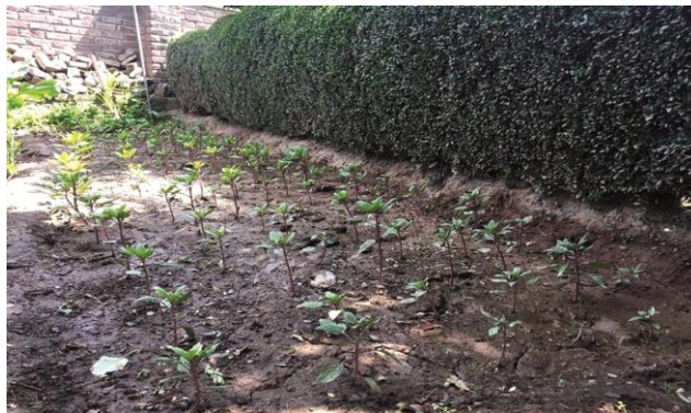
Supplementary Figure S4: Freshly cultivated plantlets of Celosia cristata .