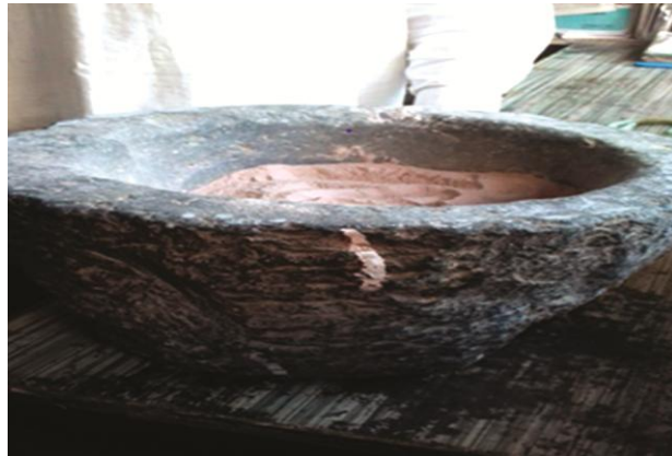
Supplementary FigureS3: “The powdered medicine” or “Safoof” prepared in large mortar and pestle.