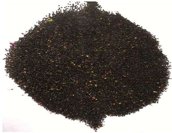
Supplementary Figure S1: Seeds of Celosia cristata .

Email: † mthakur1@amity.edu; monika.harsh05@gmail.com