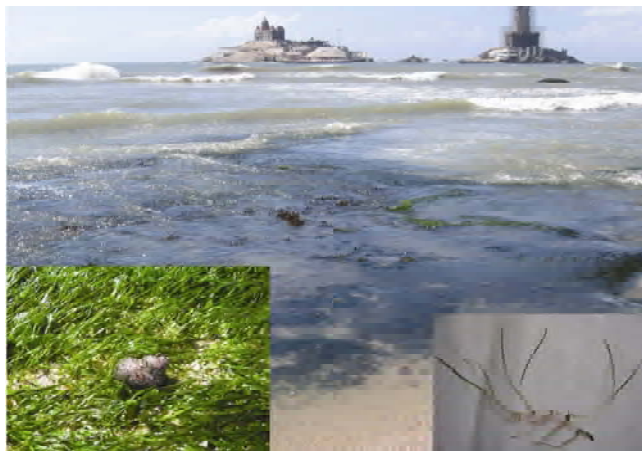
Plate 1—Station location

colonies growing around the sea grass blades were segregated and purified. Purified typical bacterial colonies were characterized by standard biochemical tests, antibiotic sensitivity pattern and 16s RNA sequence data method.